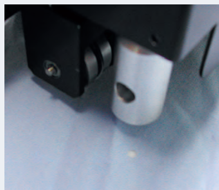
Figure 1: Drill Holes produced with speed and accuracy with the special drill tool.